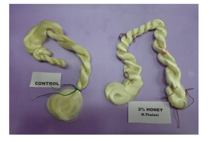
Fig.3. Raw silk reeled from 100 green cocoons produced by B. mori in the control and honey treated conditions. Note significant increase in the output of raw silk and its colour under treatment conditions

economic parameters indicates that the honey modulates the tissue protein profiles in the silkworm, either by de novo synthesis or by sequestration from other tissues. Both these mechanisms are likely in B. mori .