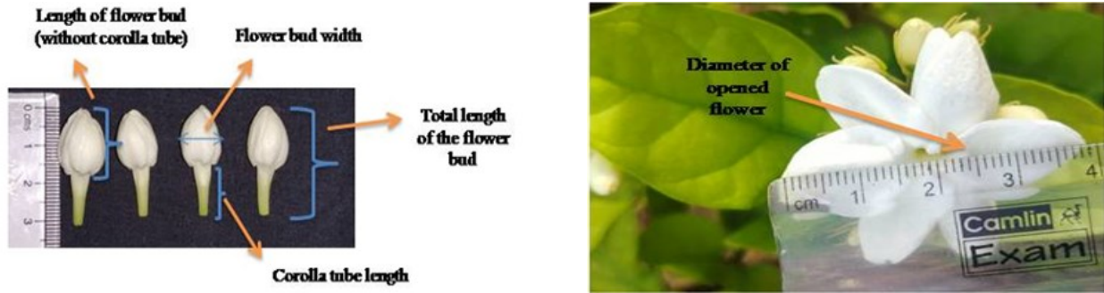
Fig. 2. Flower quality parameters

(2015) for J. sambac . The present investigation also supports the earlier observation of Singh et al. (2020) that quality parameters in guava ( Psidium guajava L.) were significantly influenced by planting system and planting density. They reported that the highest fruit length and width respectively, were produced in the Square system of planting (6.61 cm and 6.99 cm) followed by the Hedge row system (6.55 cm and 6.97 cm). These results are also in agreement with the findings of Kumar et al. (2015) in fig ( Ficus carica L.) and Wu et al. (2020) in perilla sprouts ( Perilla frutescens L.).