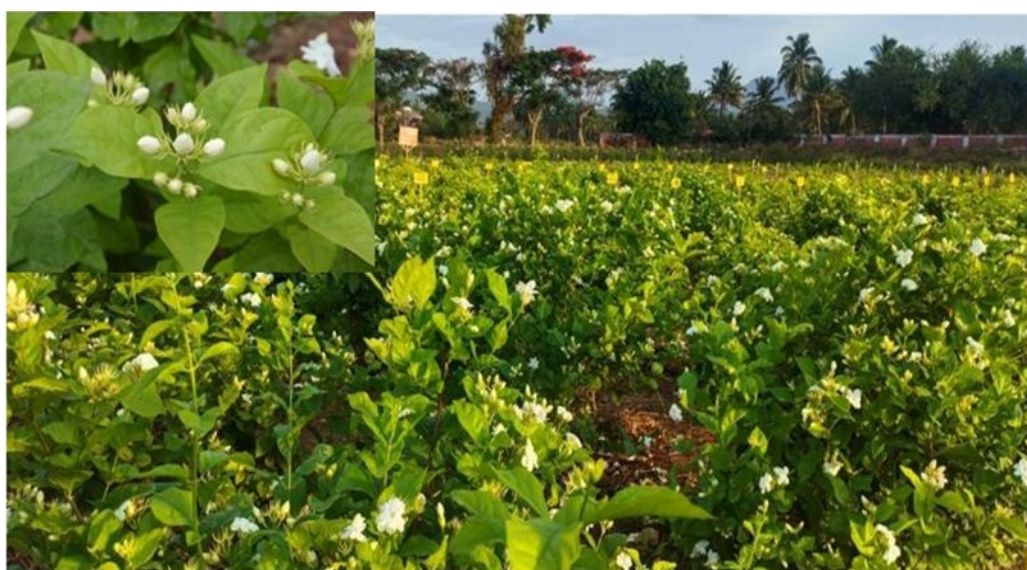
Fig. 1. New clone 'Nine Budded Gundumalli'

Factors like climate, soil, cultural manipulations and interactions considerably influence plant growth and flower quality. Pruning time and pruning level also play a prime role in deciding the size of the flower buds, as reflected by the width and length of the bud. Gibson (1984) and Anderson (1991) reported that pruning influences flower quality and increases flower size along with vigour of Jasmine plant. Khattak et al. (2011) also obtained larger flower size due to better vegetative growth, congenial climatic condition and a large quantity of reserve food production due to pruning time in Rose ( Rosa hybrida L.). Thus, the increased availability of photosynthates due to enhanced vegetative growth of a plant which might have been diverted to the sink and utilized for the production of better quality of Jasmine flowers, which conforms with the earlier findings of Ghulam et al. (2004) for Rosa sp., Porwal et al. (2002) for Rosa damascena , Kalaimani et al. (2017) for J. sambac , Nair et al. (2009) for J. sambac , Adnan et al. (2013) for Rosa centifolia ; and Lokhande et al.