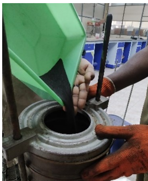
Plate 1. Gyratory Seed shaker for size grading