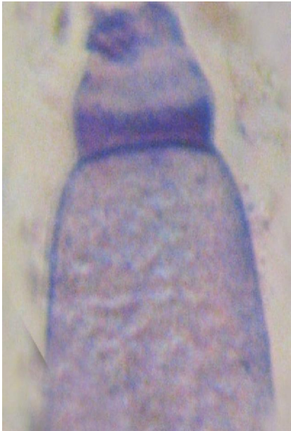
Fig. 3. Fine bristles and septum.

of genus Stenophora because of its distinctness i.e. brush like broader in between protomerite and deutomerite and epimerite modifies in fine bristles (Fig. 3).