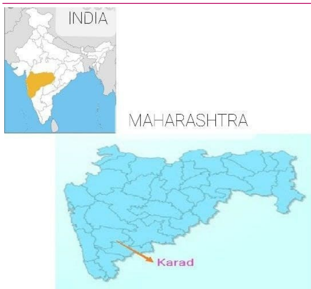
Fig.1. Location map of Karad tehsil.

omorium minimum . It was followed by order Orthoptera comprising 1 species Gryllus personatus belonging to family Gryllidae that was followed by order Diptera comprising 1 species Culex pilosus belonging the Family Culicidae, followed by the order Coleoptera comprising 1 species Gastrophysa viridula belonging to the family Chrysomelidae.