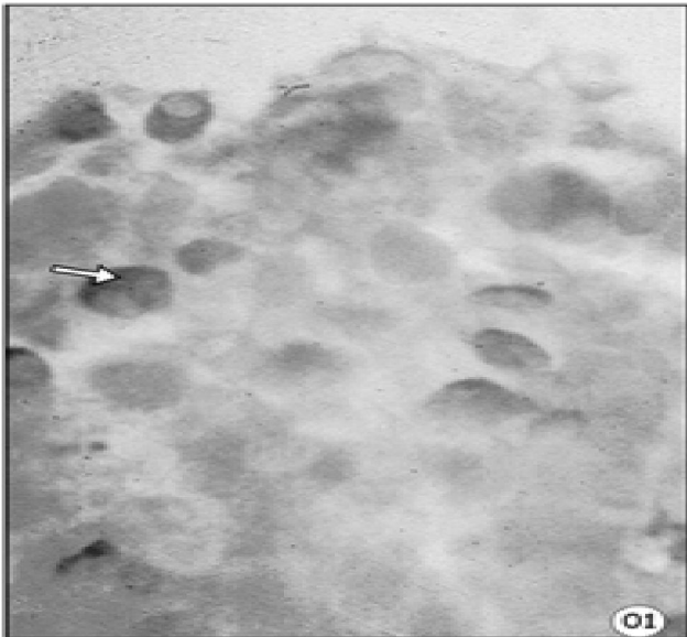
Fig. 1. Pituitary gland showing turgid cyanophils (→) X 100.