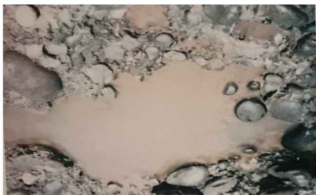
Fig. 5. General view of rock pool 3.