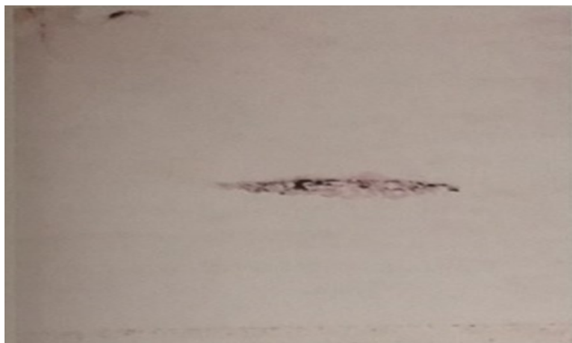
Fig. 1. Rocks in the river Chenab during floods.