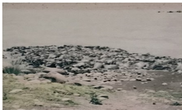
Fig. 2. Rocks in the river Chenab during winter.