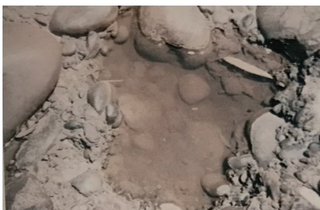
Fig. 7. General view of rock pool 5.