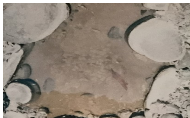
Fig. 6. General view of rock pool 4.