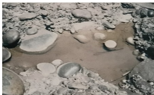
Fig. 4. General view of rock pool 2.