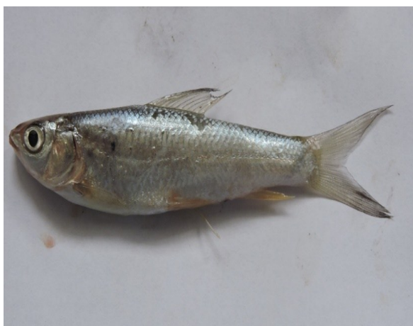
Fig. 1. Bangana dero (Hamilton, 1822).

The present study reported that the total length of the reported specimens ranged from 8.77 – 10.14 cm and weight ranged from 6.74 – 10.61 g. Descriptive statistics of morphometric traits for the