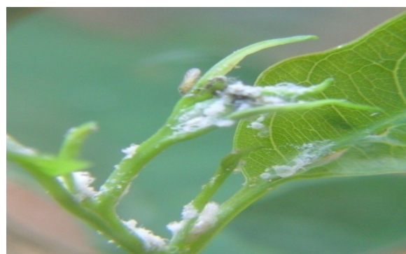
Fig. 2. White wax secretion of B. occidentalis on a Eucalyptus bud.

for the study of fertility. Fecundity of females was assessed on 140 couples of B. occidentalis by counting the number of eggs laid per day and per female until the death of the female.