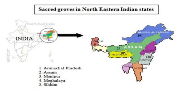
Fig. 1. Map of Northeast India showing numbers of sacred groves in North Eastern Indian states.

Upadhyay, K.K. et al. / J. Appl. & Nat. Sci. 11(3): 590- 595 (2019)