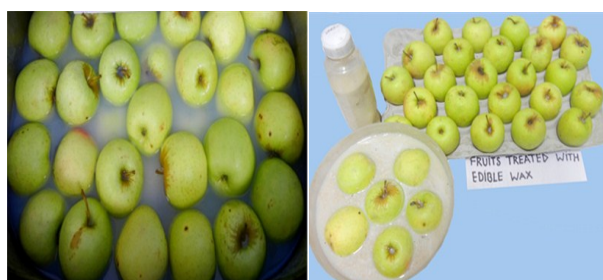
Fig.3. Fruits treated with score fungicide and edible carnauba wax.