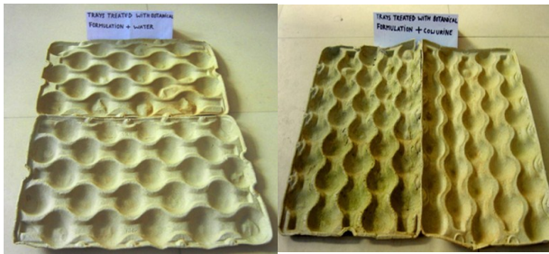
Fig.4. Trays impregnated with BF1 and BF2.