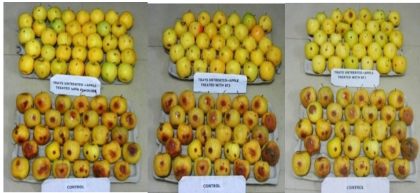
Botanical formulation -1 treated, Botanical formulation -2 treated, Fungicide (Score) treated