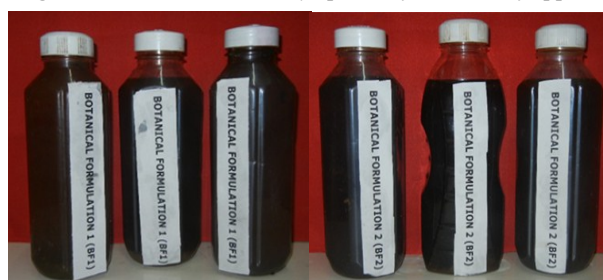
Fig.2. Botanical Formulation 1 (water based) and 2 (Cow urine based)