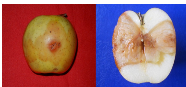
Fig.1. External and Internal symptoms of white rot of apple.

In the present study, survey of the important marketing yards in Shimla and Solan districts of Himachal Pradesh was conducted during the peak harvesting season